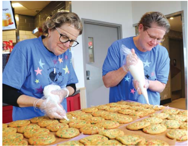
Volunteers decorating Holiday Smile Cookies.