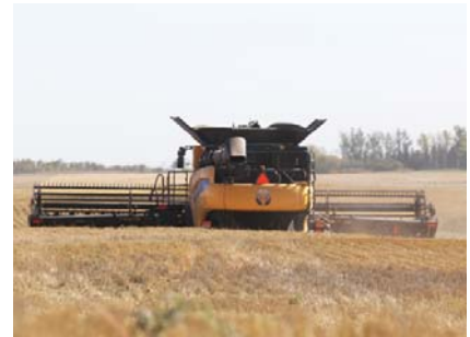
Above and right: The 2025 Harvest of Hope crop being taken off north of Moosomin in October.