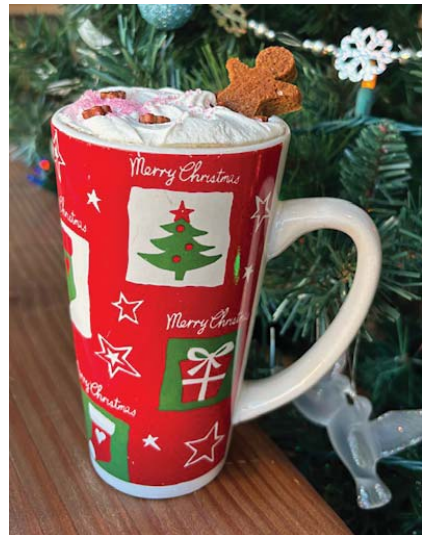
Witch's Brew's gingerbread brown sugar hot chocolate.