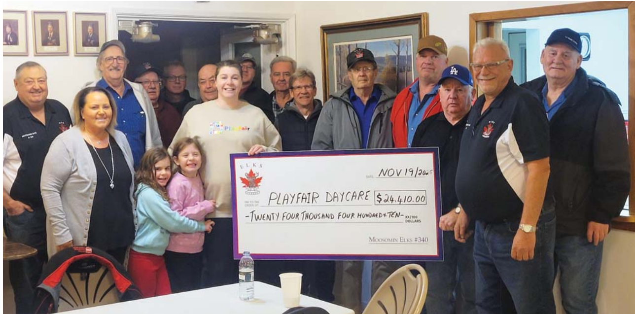
The Moosomin Elks presenting a donation of $24,410 to Playfair Daycare from proceeds of their 50/50 draw, along with a few other donations.