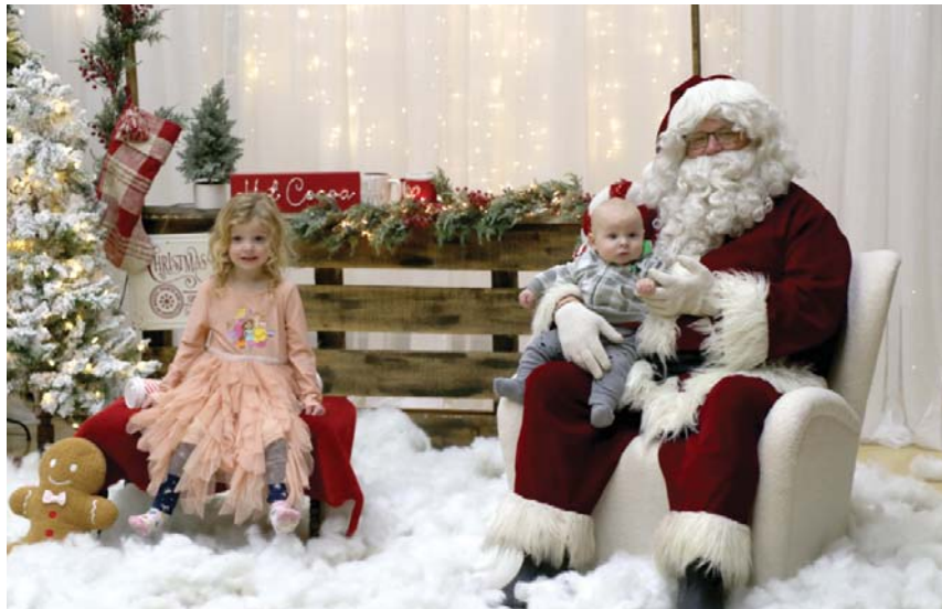
Last year's Santa Day in Moosomin.