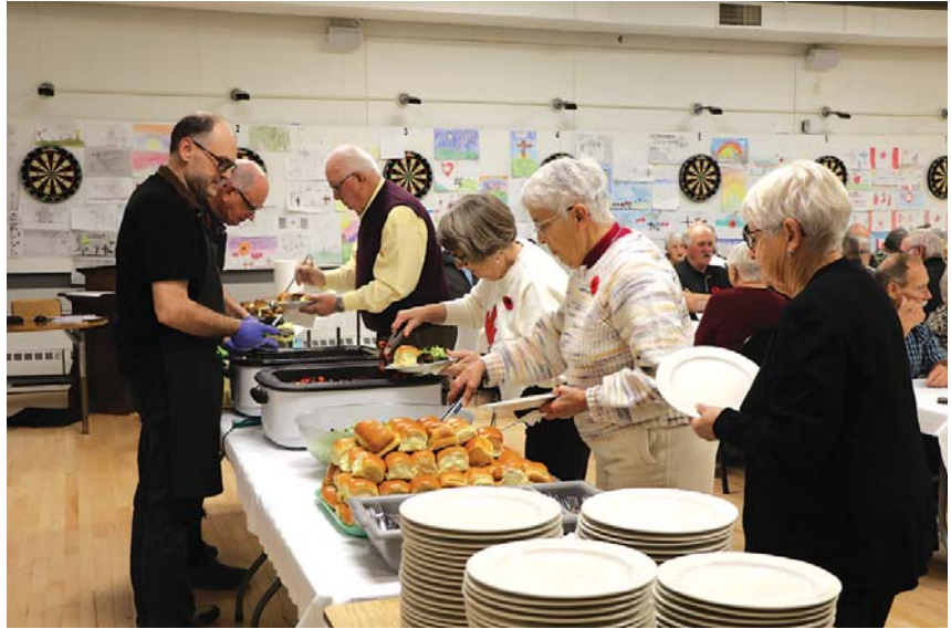
The Legion's Remembrance Day supper on Nov. 11. On Dec. 7 the Moosomin Legion will be holding a free Christmas supper for military, RCMP, Legion members and seniors.

"Part of the Legion's motto is to serve, which involves our veterans, RCMP and their families. Part of doing that, especially at this time of year, is addressing the social isolation that can affect many older members of the community. Their kids and grandkids might not be around or close to here, so they might not have anyone around for the holidays. This way, at least we can give them something to get out and be with others closer to the holiday season."