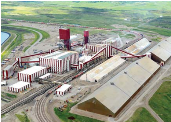
An aerial photo of Nutrien Rocanville.

"This level of support is significant," says Mbanga. "The government recognizes the role we can play in reducing emissions and mitigating global warming. Their financial backing is critical because despite Nutrien's size, we compete internally for capital across numerous projects—terminals, rail, other mines, and more. With over 20,000