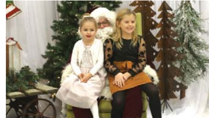
Kids and families taking pictures with Santa during Santa Day 2022.