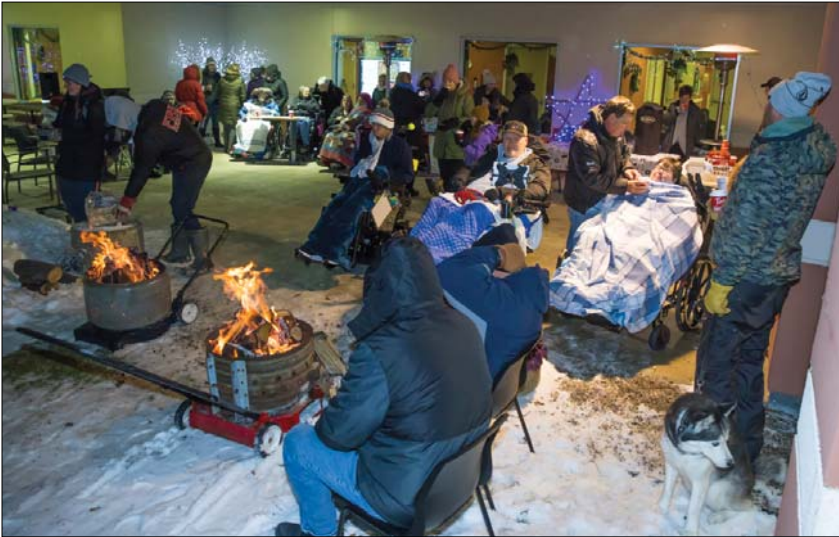
The Sparkle of Life Tree Lighting Ceremony last year in front of the South East Integrated Care Centre. There were bonfires, hot chocolate, a raffle table, and the lighting of the trees. The event was a fundraiser for the Moosomin Long Term Care and Health Care Foundation.