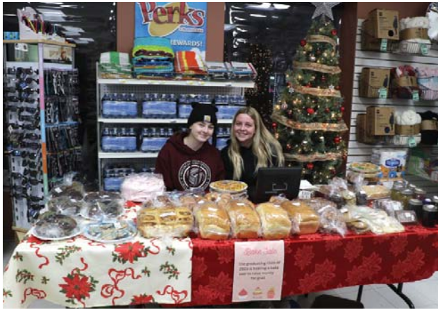
Grade 12 students selling baking last year during Rocanville's late night shopping.