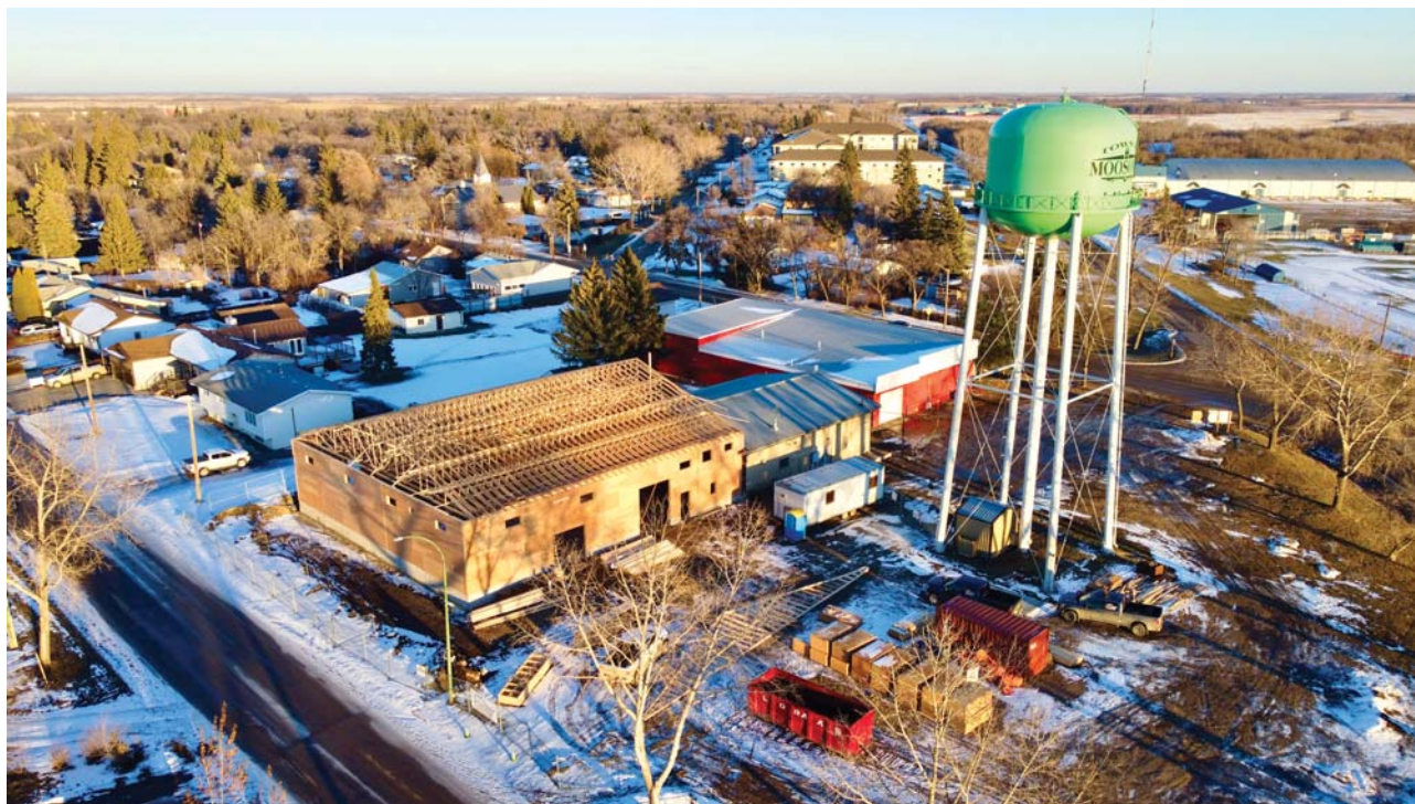
Work continues on Moosomin's new water treatment plant.