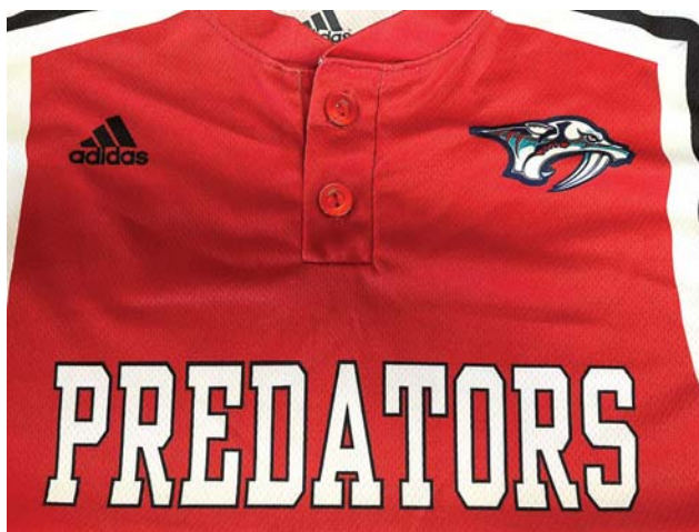
A new adult women's fastball team—Ladies Predators—in Moosomin has been created, joining the Westman Ladies Rec Fastball League. Above are their newly ordered Predators jerseys.

people from the area to join their team.