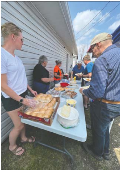
People being served lunch.