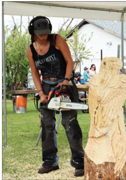
Two of the chainsaw carvers working on a bird and a bear.