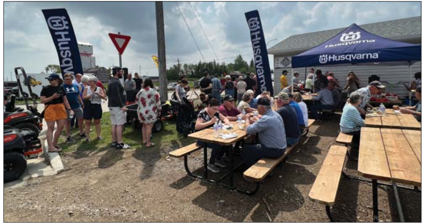
There were lots of people out for lunch on Friday at Les' Small Motors 20th anniversary celebration.