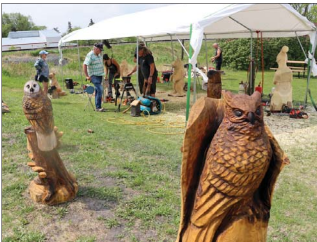
Some of the finished pieces of chainsaw art.