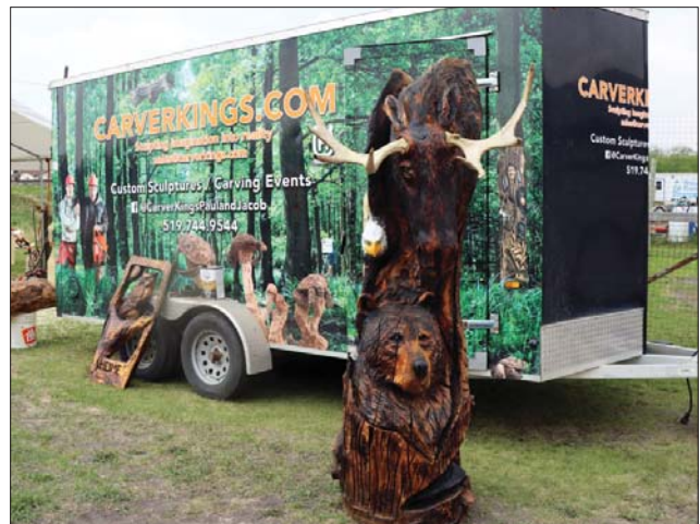
The Chainsaw Kings trailer with a chainsaw sculpture out front.