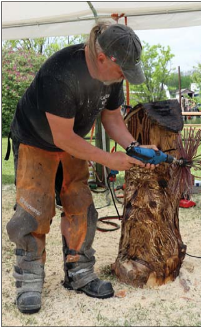
One of the chainsaw carvers starting to work on a piece.