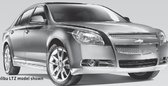
Malibu LTZ model shown

EF HWY: 11.4 L/100 km - 21 mpg CITY: 15.9 L/100 km - 15 mpg