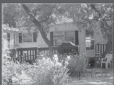
Furnished Mobile - $27,000 Oak Lake Resort