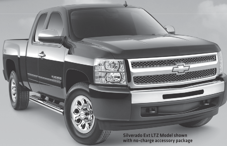
Silverado Ext LTZ Model shown with no-charge accessory package

INCL. UP TO $14,000 PRICE ADJUSTMENTS* (SILVERADO) & 0% PURCHASE FINANCING ON SELECT MODELS†