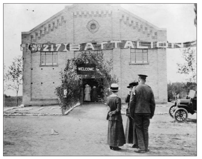
Moosomin Armoury - June 1916

Extensive restoration and renovation have been done. The Moosomin Armoury Hall has capacity for 300 and is air-conditioned and equipped with a fully stocked kitchen, bar, and sound system. It is ideal for BUSINESS MEETINGS, WEDDINGS, FUNER-ALS, CHRISTMAS PARTIES and various COMMUNITY EVENTS.