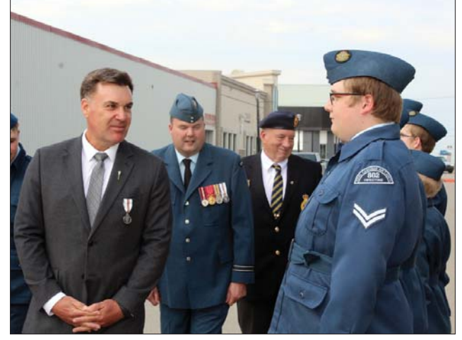
Above left and right: The cadets' year end inspection and awards. Right: The Cadets at the Moosomin Cenotaph during a Remembrance Day ceremony.