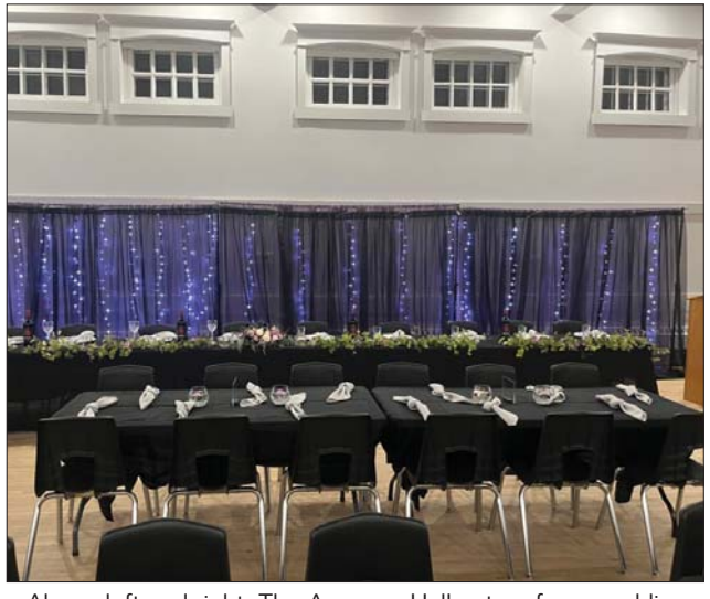
Above left and right: The Armoury Hall set up for a wedding