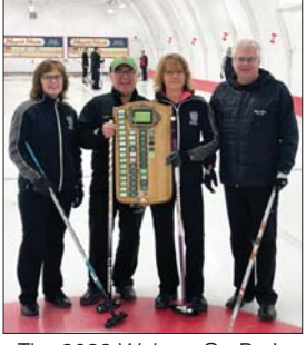
The 2023 Welwyn St. Pat's Bonspiel Champs

Our rink's success is based on the fact that it is still 100 per cent volunteer operated. All of the ice making, maintenance, all events are run by volunteers. If you live in the Welwyn area, you will likely take a shift volunteering at our rink at some point!