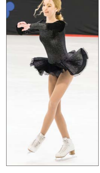
Some scenes from Moosomin's annual Skating Carnival.