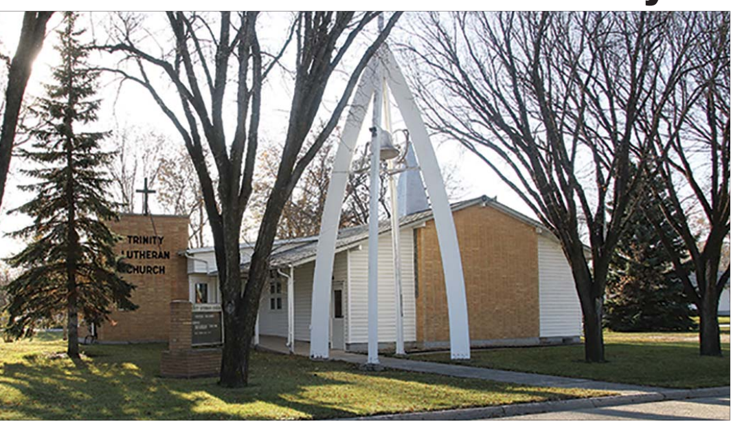
Trinity Lutheran Church in Moosomin.