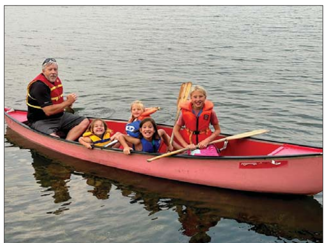
Moosomin Baptist Church has a variety of programming available throughout the year to people of all ages. Anyone is welcome to participate in the programming.