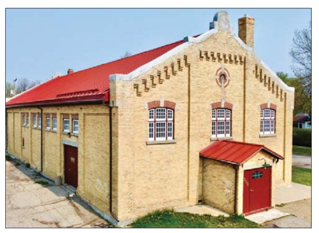
Moosomin Armoury - Today