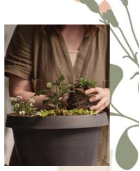
Greenhouse - Florist - House Plants - Weddings - Landscape Design

1611 Broadway Ave, Moosomin, SK 306 435 2829 - www.westwindflorist.ca