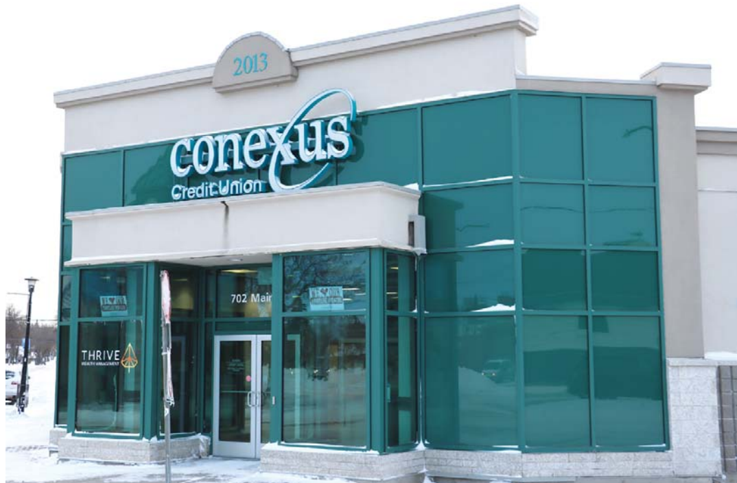
The Conexus Credit Union Moosomin Branch at the corner of Main Street and Broadway Avenue.

Now that the merger announcement has been made public, a due diligence business case process will occur, which will take several months. After that, the individual boards would need to vote on the idea, then if the boards are in favour, the membership will have their chance to vote. That membership vote could happen in June 2025, with the merger possibly taking effect by January 1, 2026.