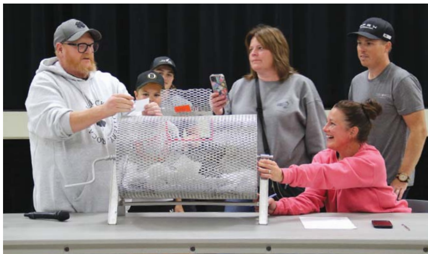
The Lucky Lottery grand prize draw being made.