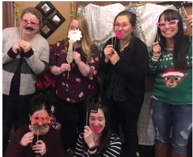
Above are photos of the annual ladies night at the New Fortune Family Restaurant in Rocanville.