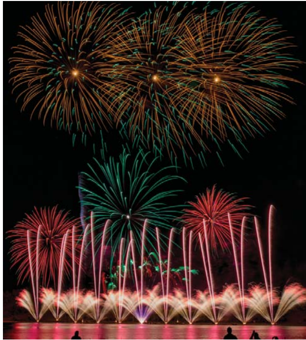
A scene from the Living Skies Come Alive fireworks show in 2019 at Moosomin Regional Park. The fireworks are back this year, with two shows planned for the August long weekend along with bands, food trucks, and a market.

"We would like to upgrade the marina eventually, and we are looking at expanding the water treatment plant as well. We need another holding tank, we are going through so much water because there's more people out there, so that's the game plan."