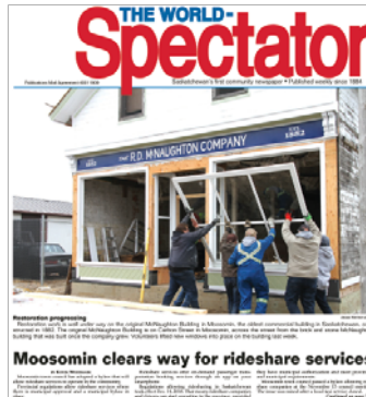
This was the front page of The World-Spectator five years ago on November 25, 2019.

The Medicine Hat Clay Products Company received a contract for some thousands of tons of tile for use in the reconstruction of the Lake Louise Chateau.