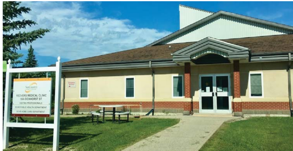
Redvers Health Centre