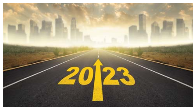
Fhanks to the local students for sharing what they think ies ahead in 2023!