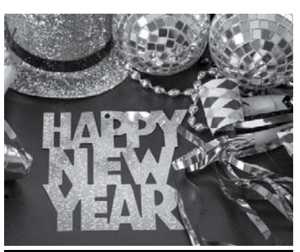
Happy New Year to wonderful customers like you who have helped make our year a success! All the best in 2023!