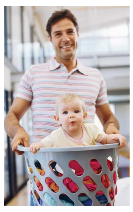
More and more men are deciding to stay at home to look after their children.

Paternity leave was unthinkable not so long ago. However, society is changing quickly and everyone's roles are being redefined. Women have an established place in the job market and are able to make a good living; men are increasingly involved in childrearing and take on some of the household chores. Because of this, Mom is no longer the default caregiver, and more and more fathers are now putting their careers on hold to take on the role of stay-at-home dad.