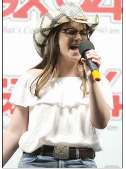
A contestant in GX94 Star Seach, which was held at the hall May 26.