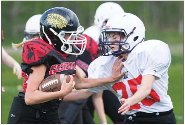
The Moosomin Generals Girls in action during a game this spring. The Generals are currently taking registrations for fall football.

Rocanville's hall building is 15,400 square feet and includes a large hall area, a stage, kitchen, bar, and a meeting room among some of its amenities