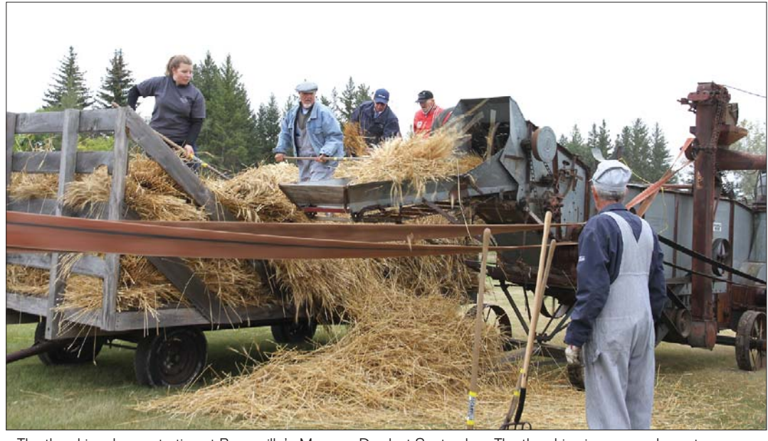
The threshing demonstration at Rocanville's Museum Day last September. The threshing is an annual event.

We have a Japanese Fire Balloon in our collection and this is another very unique item. We also have maps showing where these were dropped. It has drawn interest from many people and we even had people from Calgary University make a