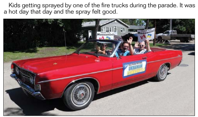
The local Ukrainian community were the honorary parade marshalls in the 2022 parade.