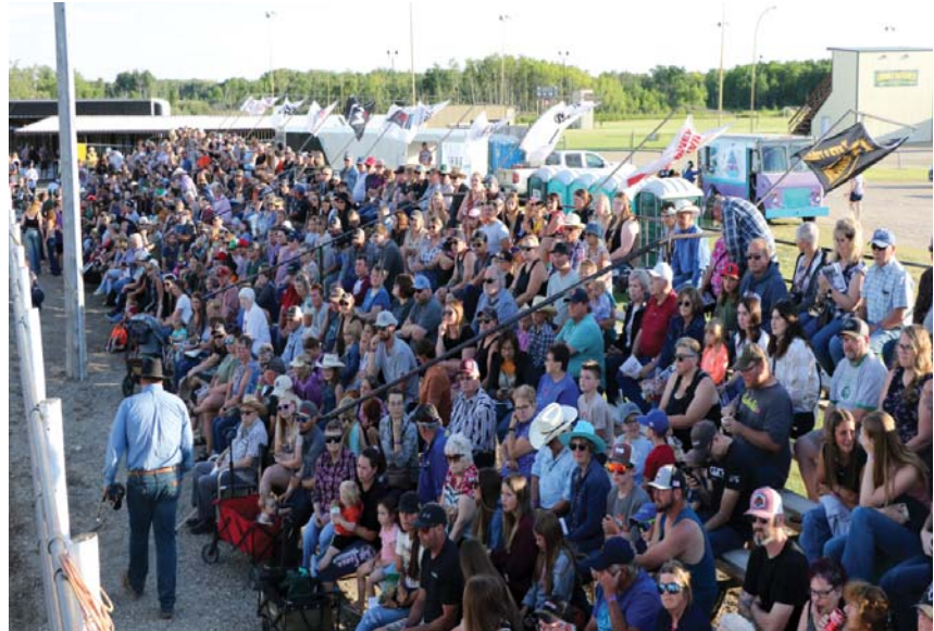
Above: There was a big crowd in attendance at the Moosomin Bulls & Broncs event on Saturday, July 13.