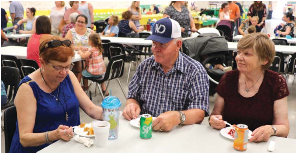
People enjoying homemade desserts at last year's Maryfield Fair.