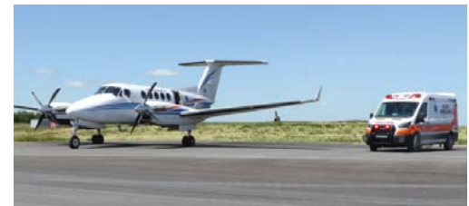
A few images of the landing of the Air Ambulance in Moosomin last week, and photos from inside the Air Ambulance.

on the runway, and look where it's brought us. Somebody got the care they needed, and that's what it's about. Thinking about it, for people to commit over $10 million to a project like this, and then for it to deliver exactly what it was built for, to land the air ambulance, it's unbelievable. I don't have words. I've been thinking of a way to capture this exactly and I just can't. I don't have the vocabulary. It's almost like a roller coaster where you get that excited feeling in the pit of your stomach. That's the way to describe it."