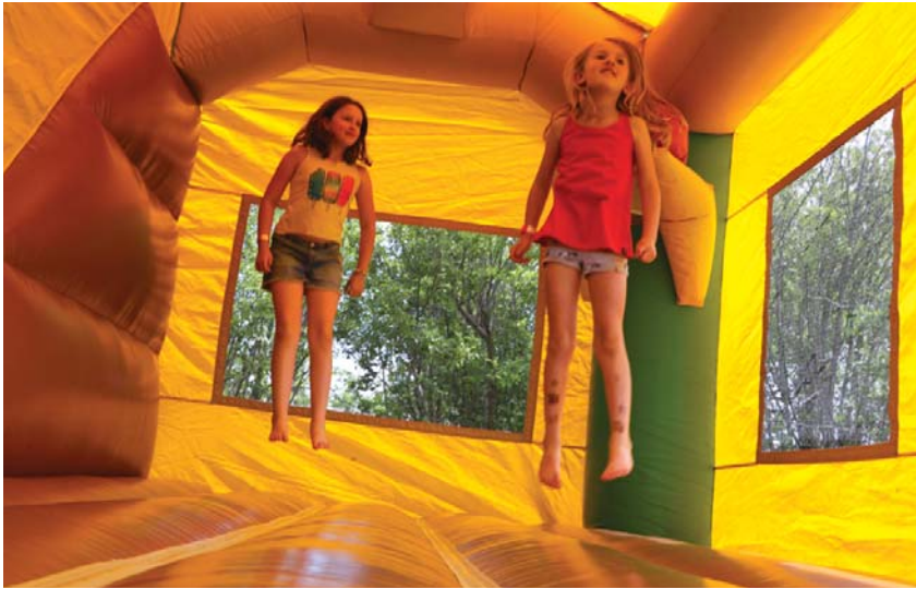
Kids enjoying a bouncer at last year's Maryfield fair.