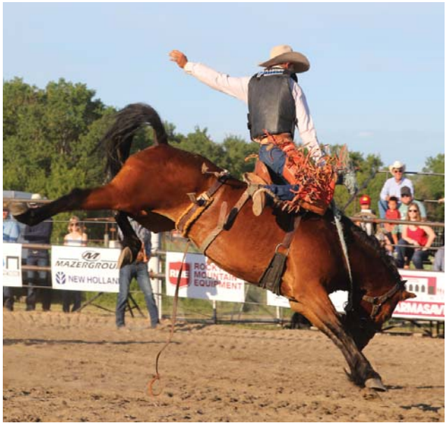
Top Left: The bull Mogley from Lazy S Bucking Bulls leaving the arena.