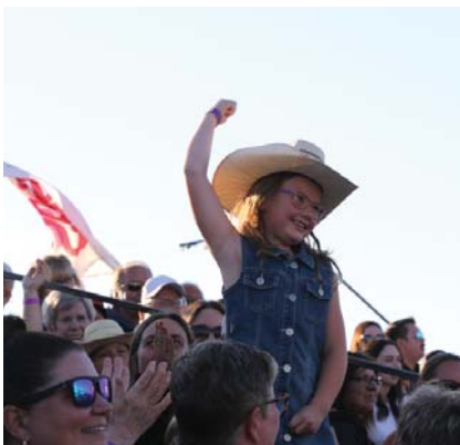
Above: A girl in the crowd having fun with the rodeo clown cheering her on.