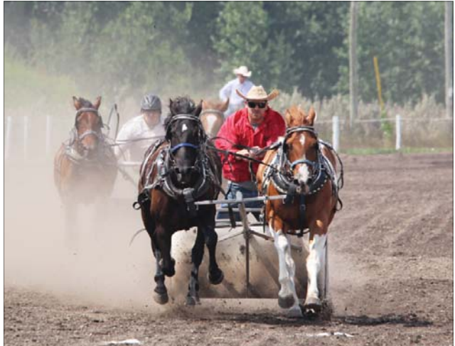
The chariot races at last year's Elkhorn Western Weekend.