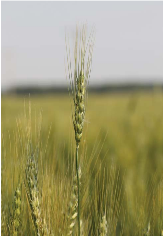
Crops are looking good across the area. This field is south of Moosomin along the number 8 highway.