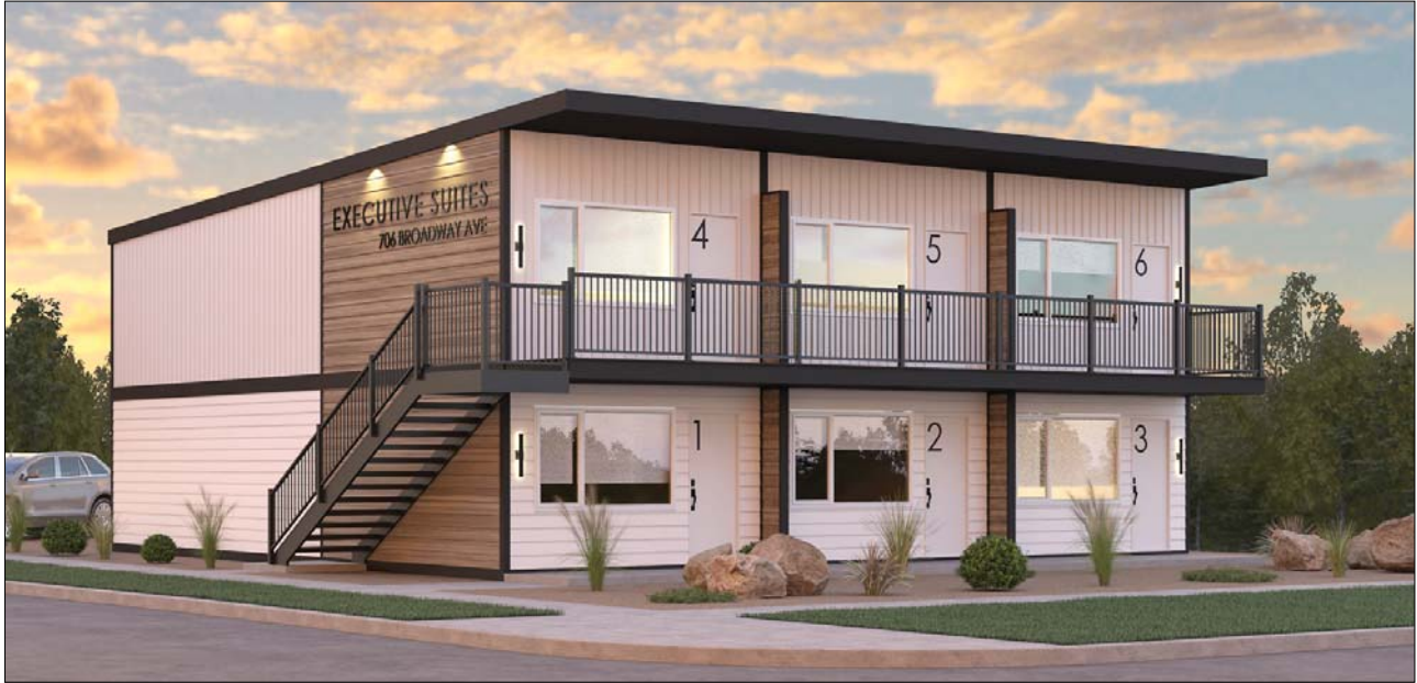
An artist's rendering of the six-unit apartment building that will be built at 706 Broadway Avenue in Moosomin.