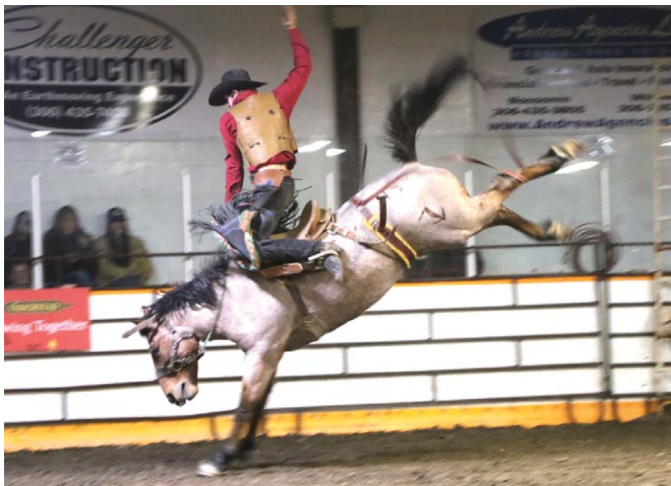
A photo from last Year's Dodge City Days Rodeo. This year's rodeo will be August 24 rather than the traditional date of the Thanksgiving Weekend.

"We have quite a die-hard group of people in Wapella, Moosomin, and