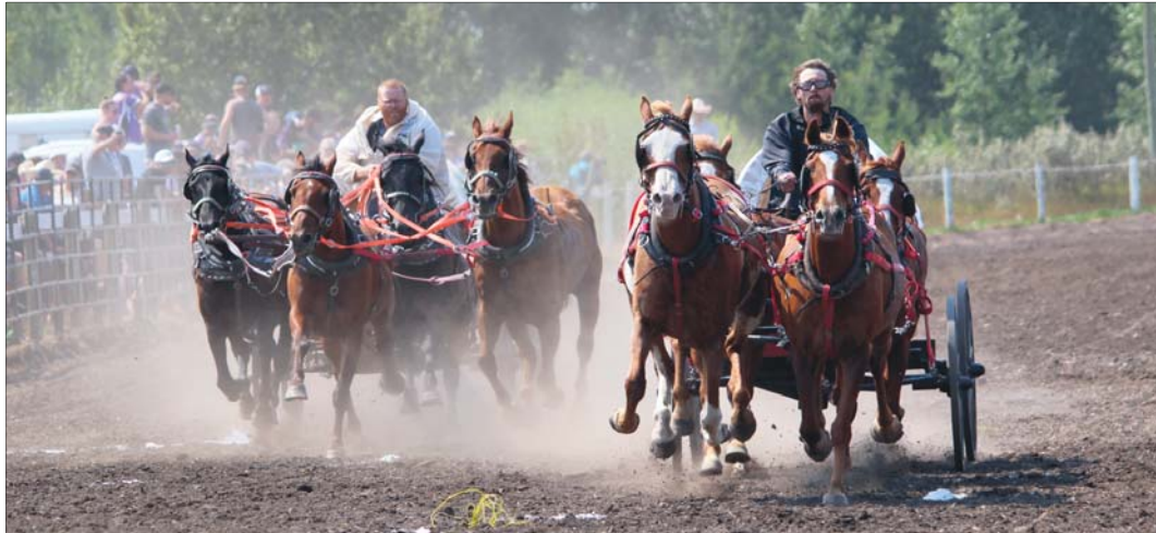
The chuckwagon races at last year's Elkhorn Western Weekend.