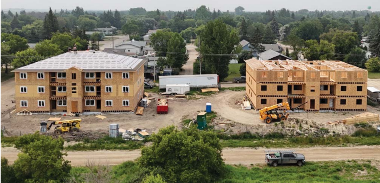
Construction continues on two new 12-unit apartment buildings being developed by Keller Developments on South Front Street in Moosomin.