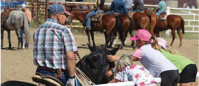
Some scenes from Spy Hill Sports Days in past years.