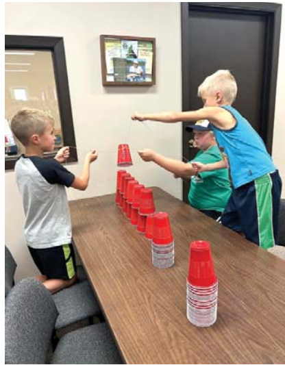
Kids participating in Esterhazy Branch Library's kids programs on Sept. 13. The two programs—Idea Hour and Storytelling—have been running since March, and includes STEAM, arts & crafts, literacy, and games for kids to engage in free of charge.

The contractor, DT Concrete, was hired to do the repairs for $2,970, plus taxes.