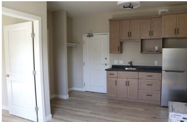
Left: Cobblestone House, a 42-unit long-term care and assisted living facility officially opened on Aug. 1, and will be having their grand opening to the public on Wednesday, Sept. 27. Right: One of the rooms on the Assisted Living Care floor, the second floor, at the Cobblestone House.