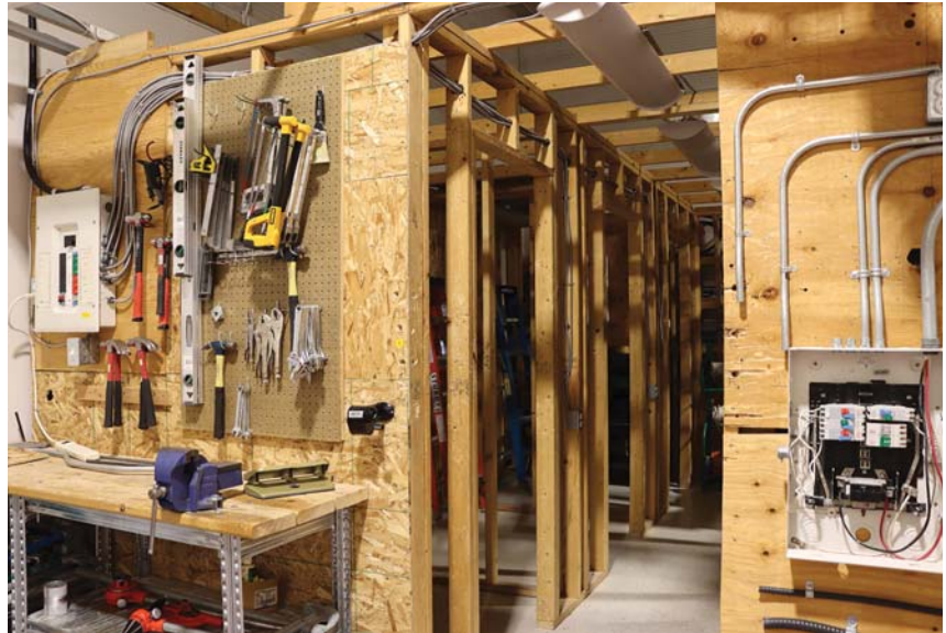
Southeast College's Moosomin campus had renovations done to their building. Above and below are photos of the renovations done in the laboratory rooms used for the college's Electrician Program.

"We're going to look at it again in the future. We're not forgetting about the program, we see that there's a need, we just also need to have the students. We can't run it for just one or two students."