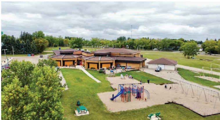
Kids enjoying the playground at MacLeod School in Moosomin, at the end of summer.

"We had a new student who came AT the beginning of June and knew no English at all, but he caught on pretty quickly. He used Google translate on the iPad often in the classroom. It's quite amazing to see, the kids love it.