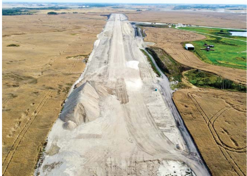
Work continues on the Moosomin airport expansion project. The new runway is oriented north-west-southeast in line with the prevailing winds.