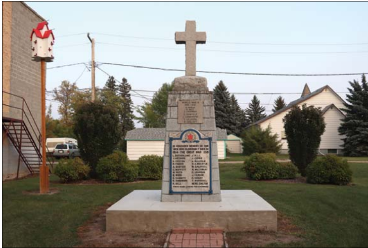
A rededication ceremony in honor of Canadian veterans will be happening on September 20 at the Cenotaph in Rocanville.