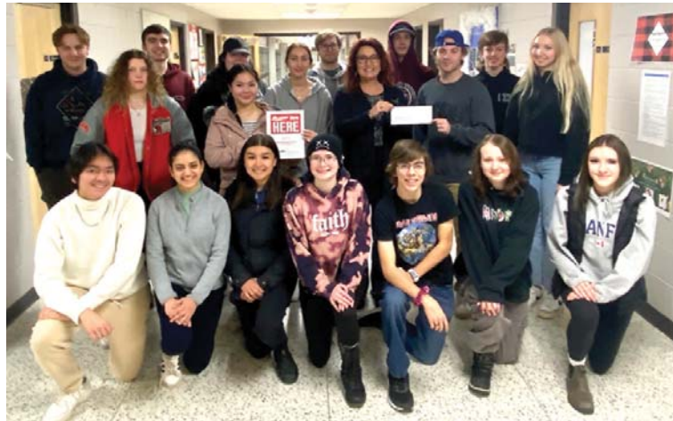
Above are the Junior Achievement group from last year's Community Futures Sunrise 2022 YouthBiz Contest, at the Weyburn Comprehensive.

Students can learn the fundamentals on how to start a business just by participating in the contest.