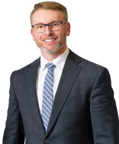
Sask Minister of Health Everett Hindley

Progress continues towards our target of adding 250 new and enhanced, permanent, full-time positions to stabilize rural and remote areas. That was something we heard coming out of our visits and tours over the past couple of summers where individuals were looking for more permanent, full-time work. In some cases, of those 250 new and enhanced, permanent, full-time positions, 196 of those are now filled. We also have the rural and remote