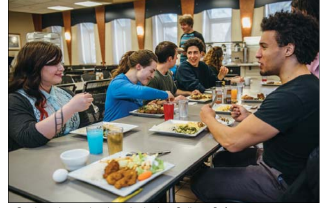
Students having lunch at the Luther College Cafeteria.

fast food. We believe convenience means providing unlimited all-day access to real food options. That's why the Luther Cafeteria is open from 7:00 a.m. to 7:30 p.m. on weekdays and from Noon to 6:00 p.m. on weekendys and holi door in addition, our 14 and 19 meal per week plans include a bonus $150 each semester to use at University of Regina food vendors and a bonus $200 each semester to use at Luther's Connection Café coffee shop. No other food service on campus offers such a compre-