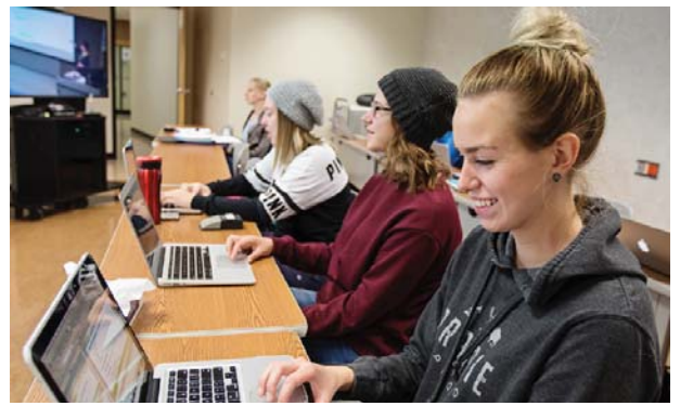
Parkland College students in class.

kton can be your answer. You can take one of several full-time Sask Polytech programs at the TTC: Agri-