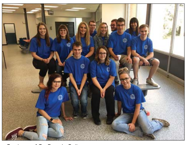
Students of St. Peter's College

the amenities under one roof. St. Peter's College, on the outskirts of the growing city of Humboldt, Sas-katchewan, invites friends new and old to visit its historic campus and ex-perience first hand the many natural wonders of the region. It's truly a place where we invite our students to "Live Your Education!" Your Education!"