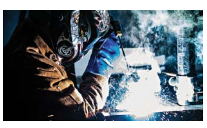
A student welding at Parkland College.

And to help you along the way, the College's scholar-ship program awards over $100,000 each academic year. Students taking a full-time post-secondary program at Parkland College in the fall of 2018 may apply for En-trance Scholarships from March to May. More information will be made available at scholarships.parklandcollege. sk.ca. Visit parklandcollege.sk.ca, call toll-free 1-866-783-6766, or follow @CollegeofChoice on Facebook, Twitter, and Instagram