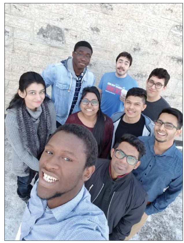
Students of St. John's College