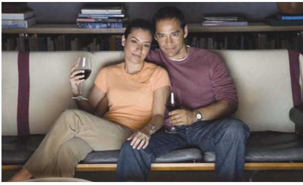
Watch a classic romantic movie on Valentine's Day

nome. However you've chosen to celebrate Valentine's Day this year, give it a perfect finishing touch by watching a romantic movie or listening to your favourite love song. Have a great Valentine's Day!