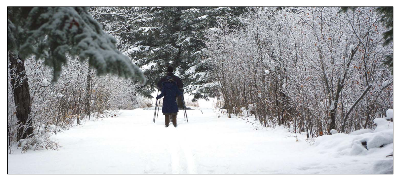
Skiers enjoy a winter day at the Rocanville cross-country ski trails.