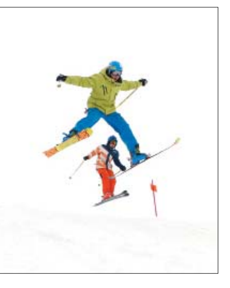
Snow tubing, snowboarding and skiing at Asessippi Ski Area and Resort.