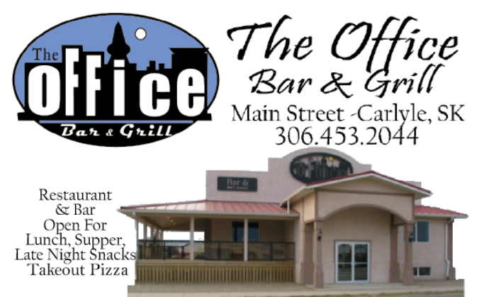
The Office Where You Don't Mind Putting In A Little Overtime!