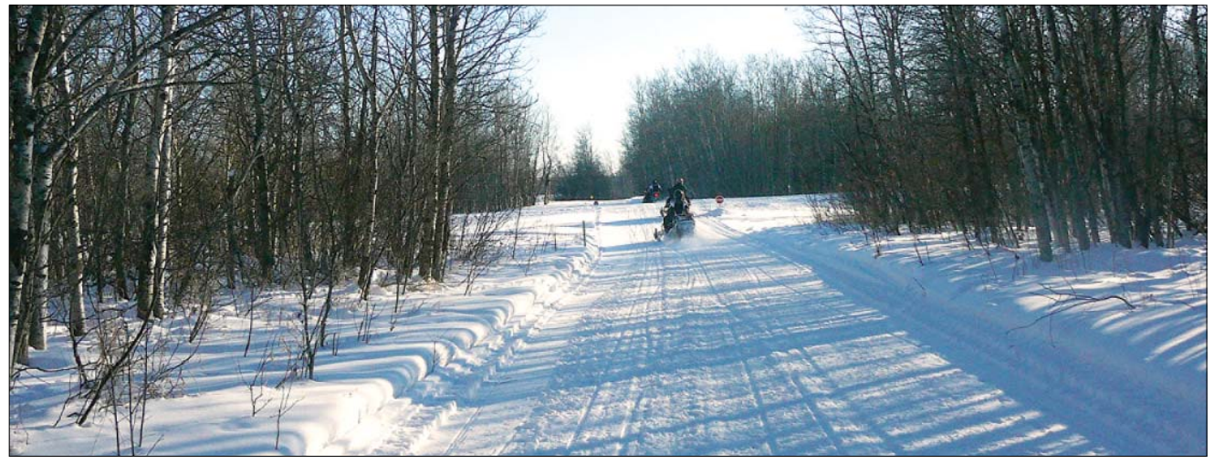
A rider enjoys the trails