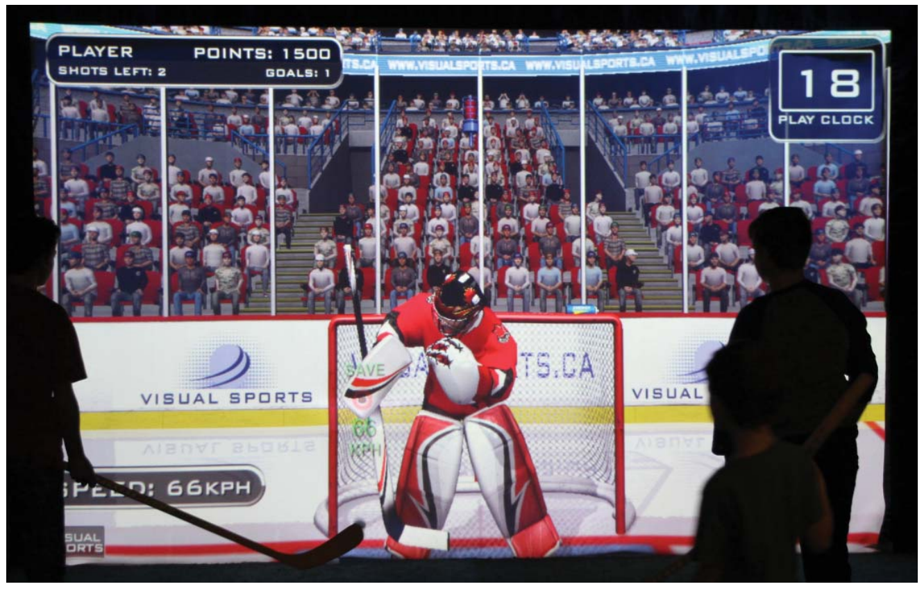
Playing on one of the sports simulators at the Sportsplex.