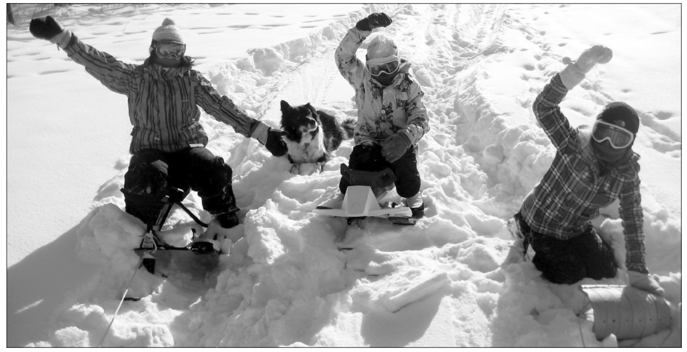
Sledding in the Asessippi Parkland