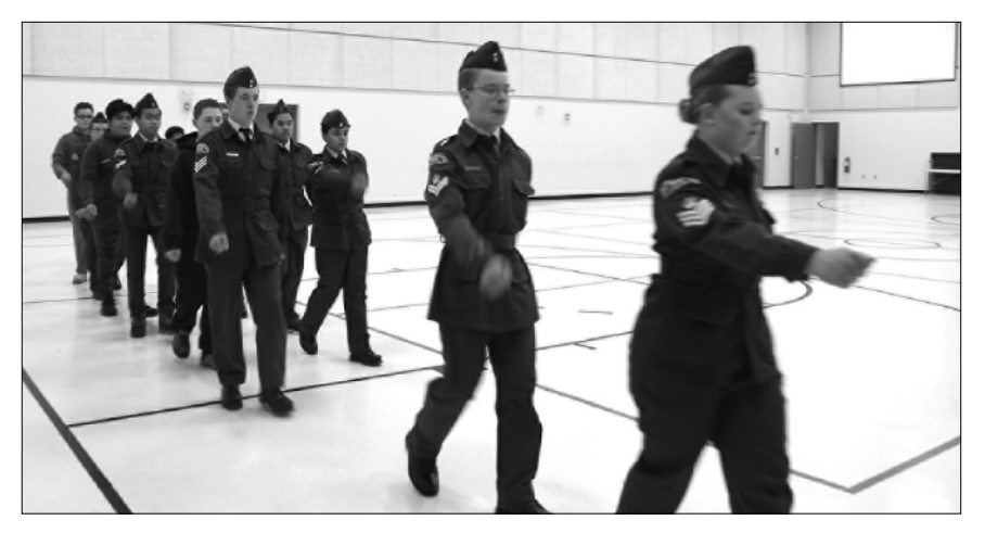
Top: Ukrainian dancers performing at a fundraiser at the Conexus Convention Centre. Above: Air Cadets using the Convention Centre Below: The musical "Into the Woods" at the Convention Centre