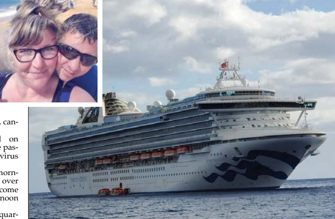
Above: The Grand Princess cruise ship that Kara and Mark Schiestel were quarantined on. Below: The view from their 10x20-foot cabin of a life boat.