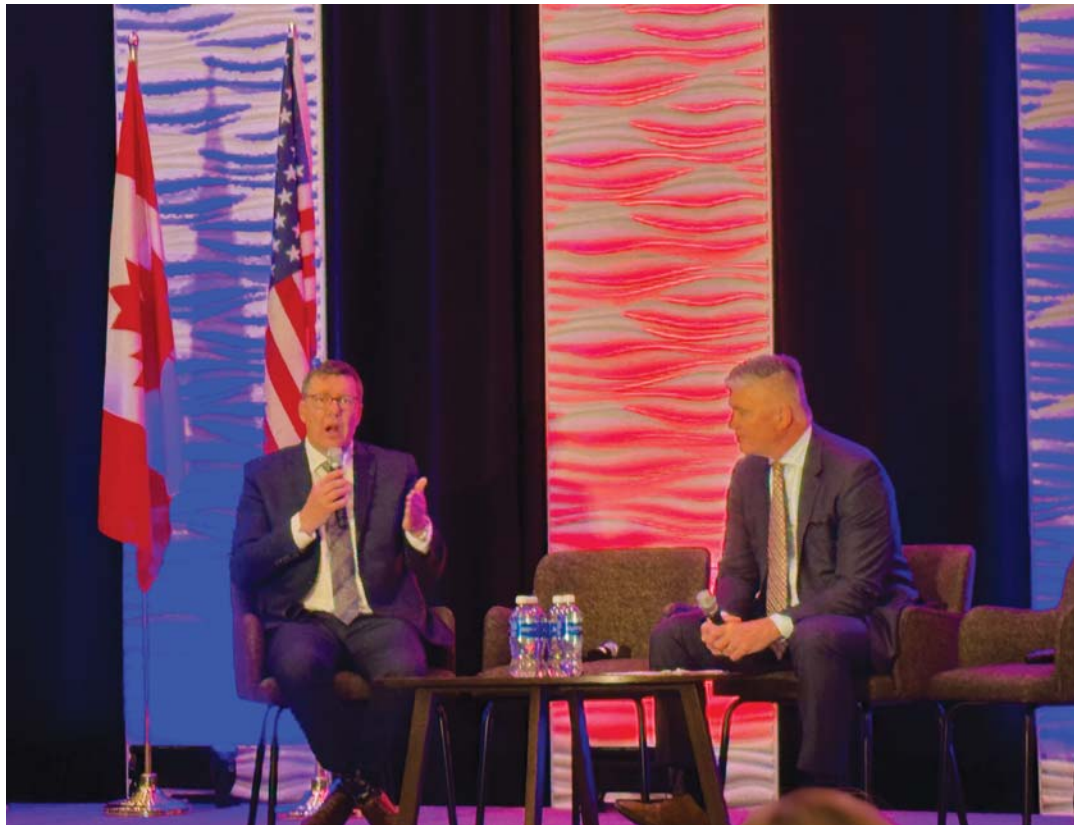
Premier Scott Moe at the Williston Basin Conference.