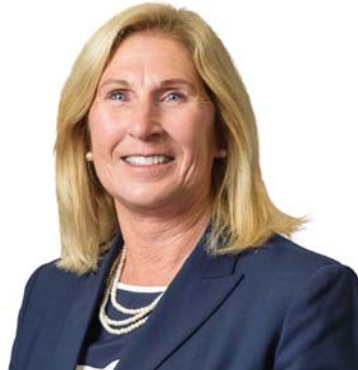
Colleen Young Minister of Energy and Resources

Exports of potash and uranium from Saskatchewan are CUSMA (Canada-United States-Mexico Agreement) compliant and not currently under tariffs. The Canadian and U.S. economies are highly integrated and are much stronger in a tariff-free environment. We would like to stay that way. Free and fair trade benefits all citizens, whether it's in Saskatchewan, whether it's in Canada, whether it's to the south of us in the United States, because the American folks