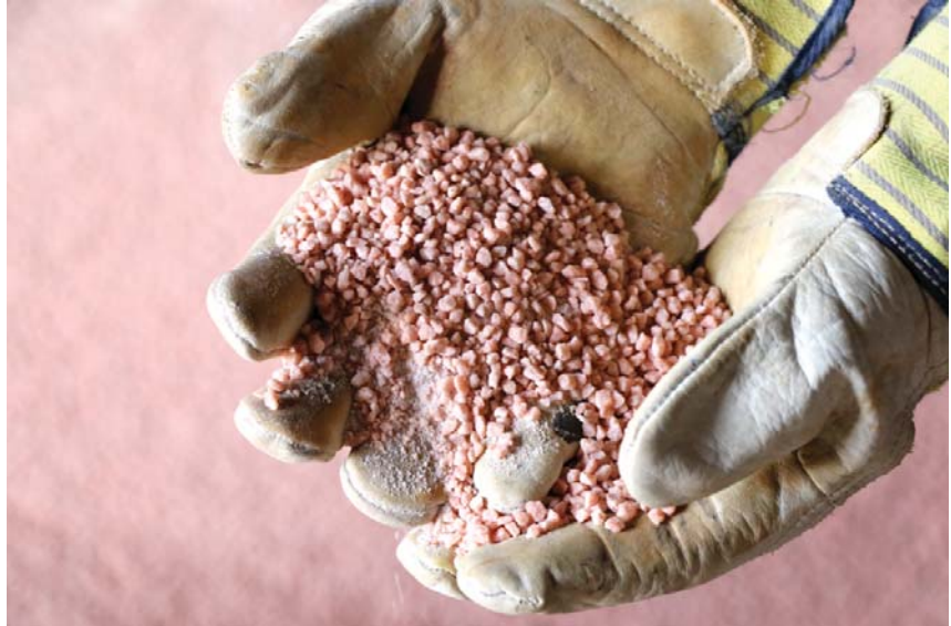
Critical Minerals Strategy. Several firms are actively pursuing lithium exploration and production in the province. The next offering is scheduled for the 2025-26 fiscal year on July 7, 2025.

Lithium is one of the 27 critical minerals occurring in Saskatchewan that will play a key role in the province achieving the goals set out in Saskatchewan's