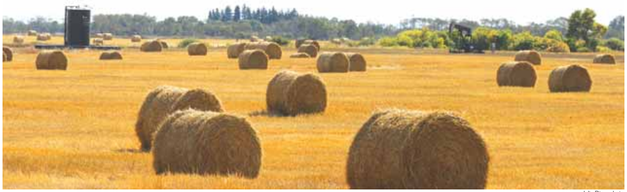
The harvest isn't over, but farmers are calling this year's harvest a bumper crop. Some report this is the best harvest of their careers.