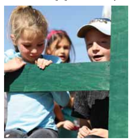
Above: Children enjoy a ride on a hay rack. Below: Running the antique steam engine.