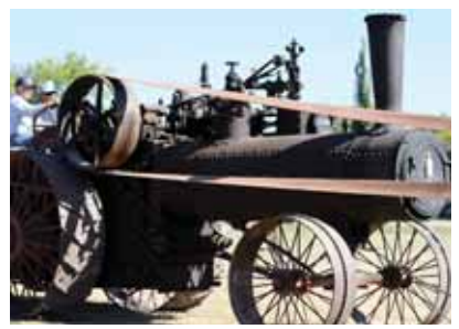
Threshing with an antique steam powered machine was the highlight of Museum Day

After the threshing demonstration, there was live music in the old legion hall, and a barbecue supper in the evening.